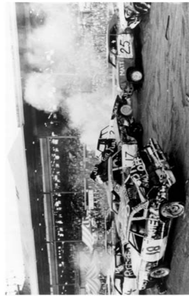
WORLD'S LARGEST DEMOLITION DERBY

In each event on August 16 th at 3:00 pm, the "Winners" (last two cars running) will receive a trophy, $40 and both drivers will be qualified to run in the Championship Event in the evening show PROVIDED they drive a car weighing between 2,600 – 4,800 pounds. (NO Compact cars permitted in this event!)